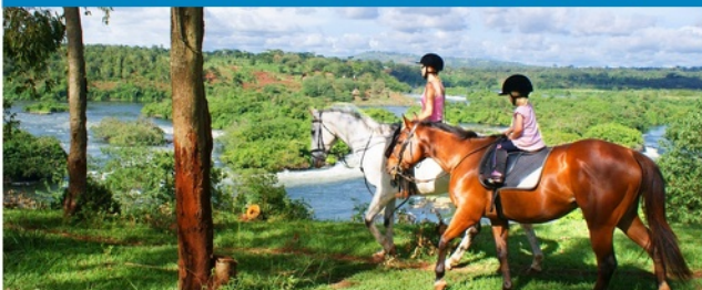
Horse Riding ($60 - 2 hr per pax)