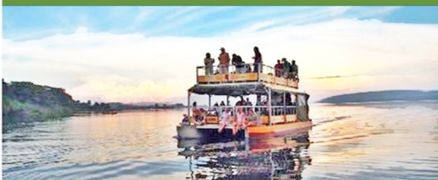
Nile lunch cruise ($30pp)