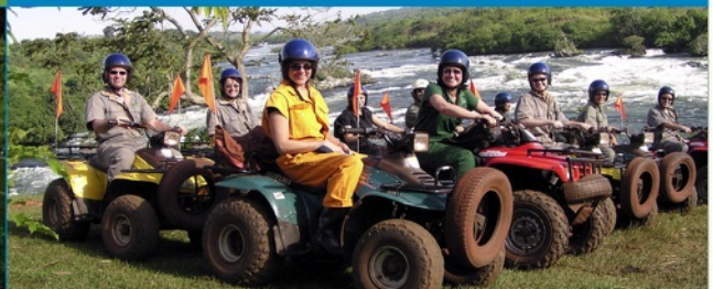
Quad Biking ($85 - 2 hr per pax)