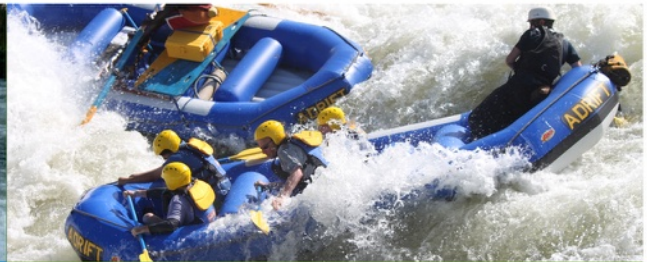
Whitewater Rafting - $140pp or Intro - $80pp (min 4 pax)