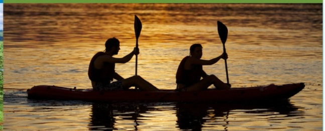
Sit on Kayaks/Stand Up Paddle Board ($75pp min. 2 pax)