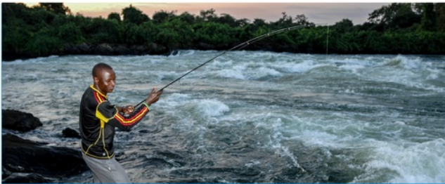
Fishing from the island ($15 per rod hire per 2 hrs)