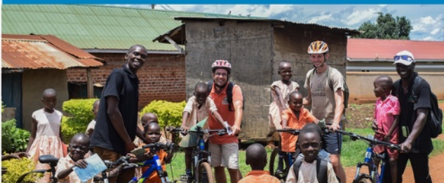
Bike Ventures ($35pp)