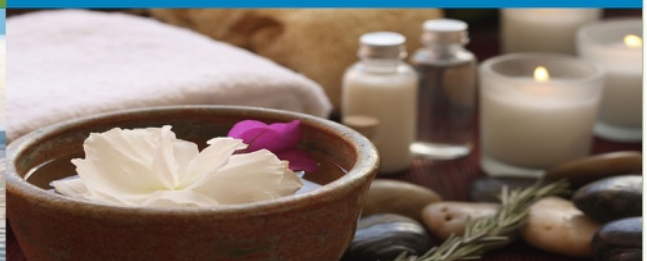
Wildwaters Spa Treatments